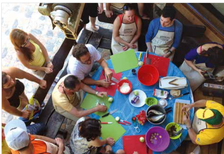
"Cook Jewish, Be Jewish" summer workshop.