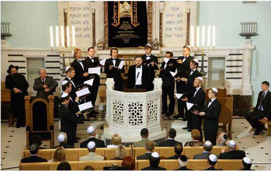
The Riga Synagogue.

The Latvian Jewish Community, which today has about 10,000 members, is the largest Jewish community in the Baltic states and second in terms of numbers if Northern and Eastern Europe (after Sweden). The capital Riga is the main center of Jewish life but there are smaller communities in Daugavpils, Liepāja, Jūrmala and other cities.