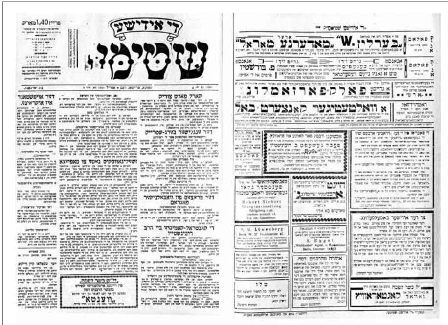
Di Yiddishe Stimme (The Jewish Voice), 1921

Jews were the largest ethnic and religious minority in Lithuania in the period between the two world wars. The Jewish culture of Lithuania, just like that of Eastern Europe as a whole, was multifaceted and diverse, and the Yiddish language was an important vehicle of communication. When Isaac Bashevis Singer received the Nobel Prize for Literature in December of 1978, he wasn't just speaking in vain when he said: "There are some who call Yiddish a dead language, but so was Hebrew called for two thousand years. It has been revived in our time in a most remarkable, almost miraculous way. ... It is a fact that the classics of Yiddish literature are also the classics of the modern Hebrew literature. Yiddish has not yet said its last word. It contains treasures that have not been revealed to the eyes of the world. It was the tongue of martyrs and saints, of dreamers and Cabbalists—rich in humor and in memories that mankind may never forget. In a figurative way, Yiddish is the wise and humble language of us all, the idiom of frightened and hopeful Humanity." Sixteen daily and 30 weekly newspapers were published in Lithuania in the pe-