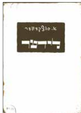
"Lider" book cover