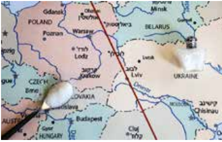
Gefilte fish line

buffalo). This fish is similar to carp and is reportedly only found at Chinese fish markets now. Incidentally, many Jewish kids in America grew up thinking carp live in bathtubs, since a live carp