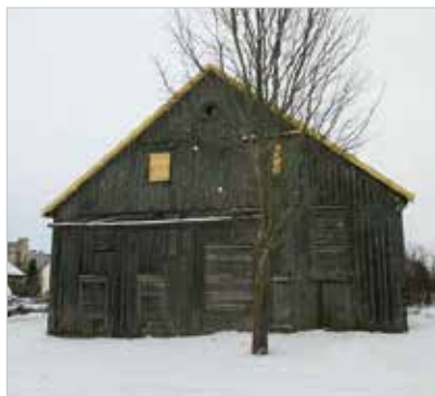
Synagogue in Tirkšliai, Mažeikiai Distr.