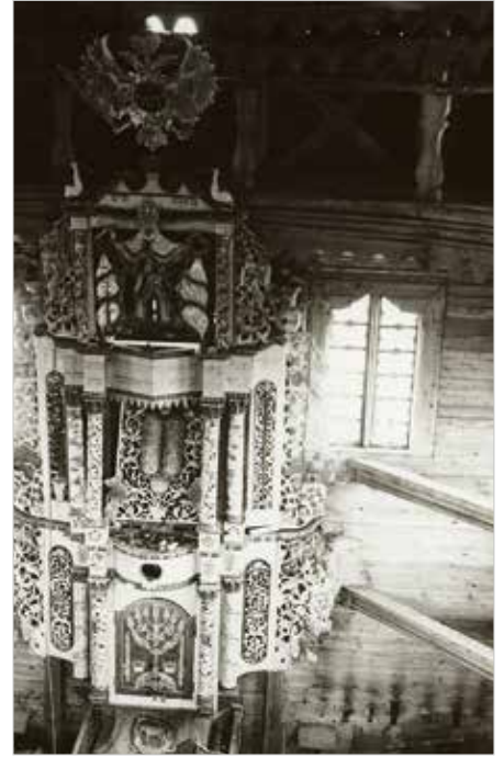
Aron khodesh of Šaukėnai synagogue (Aušra Museum of Šiauliai, No. 9907)