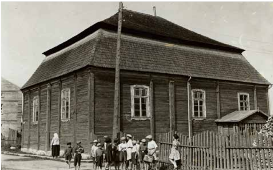
Synagogue in Pakruojis. Photo by S. Vaitkus, 1937 (Aušra Museum of Šiauliai, No. 1924)