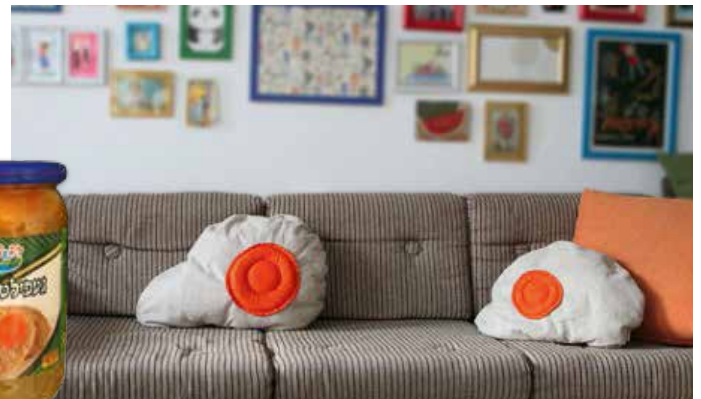
Gefilte fish cushions designed by Noam Levinson

The issue of survival is an urgent one in the history of cuisine just as much as it is in the history of humanity. Do the fittest and most delicious survive? So what are we to make of the apparent success of this boiled ball, a brownish gray mass with a slice of carrot atop, either sweet or salty, framed by a pink jelly, or just as often with a sauce of indeterminate color? Gefilte fish is an established dish in world cuisine; in the kosher food section you can find several different types and it is an essential food during the holidays at European Jewish homes. Gefilte fish is an Ashkenazi Jewish dish of epic proportions which has survived the challenges of the centuries remaining almost unchanged to the present time. Litvaks make this stuffed fish in the following way: the carp or pike is gutted, the bones are removed from, the fish fillet is combined with spices and the mixture is placed back within the skin of the fish or strips of it and boiled in a pot with carrots. The stuffed fish cools in the fish broth which gels into a jelly, is decorated with lateral slices of carrot and served with horseradish. Jewish housewives in Vilnius used to put bits of beet in the pot so the jelly would take on a pink color and a more interesting taste.