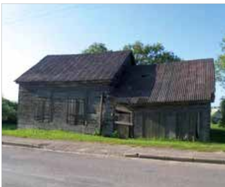
Synagogue in Kaltinėnai, Šilalė Distr.