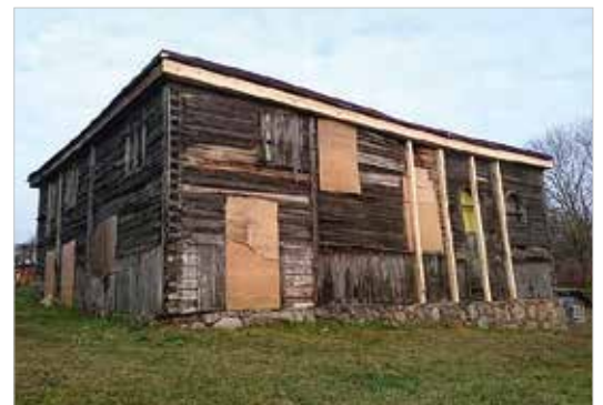
Synagogue in Alanta, Molėtai Distr.