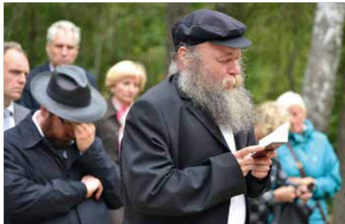
Kadish prayer during Holocaust commemoration in Šeduva.

September 2 Asia Gutermanaitė delivers a public lecture on Jewish languages in Jonava and Jewish folktales were read at schools in the Kėdainiai region, where there was also a class on how to read Jewish headstones.