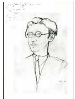
Portrait of Abraham Sutzkever (by Yankl Adler)

"Lider" is first published collection of poetry by Sutzkever and was issued in 1937. It was hailed by critiques as one of the most innovative collections of poetry for its visual and linguistic forms. The title "Lider" could just as well be translated as "Poetry" instead of "Songs." Sutzkever's poetic language is like a symphonic orchestra with many metaphors, neologisms and a modern sense of rhythm. Fine musical phrases underpin the poetry sometimes indistinctly heard by the reader, a window on the worldview of the poet and the people around him in his younger years.