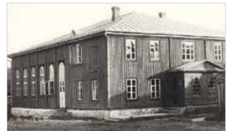
Synagogue in Žiežmariai, YVA photo collection no. 211AO3