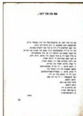
Poem "Here I Am", 1935